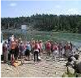
Just a couple of places left!—somewhere!