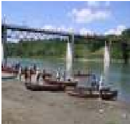
That's Klaus alone there. He is probably looking for rowers.