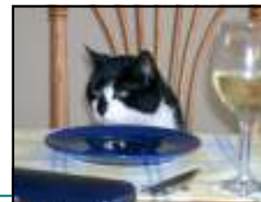
THAT was GRRREAT!