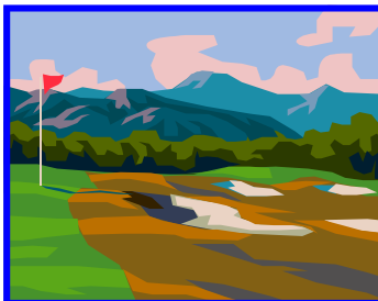
Golf Tourney Wednesday Sep. 3 2008.

The Seniors Alpine Ski Club and the Rocky Mountain Seniors Club will hold their annual golf tournament at Meadowlands Golf Club near Sylvan Lake with an 11:00 AM starting time. Meadowlands is located approximately 10 miles west of Red Deer on the corner of highway #11 and #781. Cost of the tournament is $80.00 per