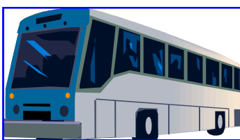
More fun and better than driving 1:45 minutes.

There will be a bus taking RMSSC members to the event leaving from Snow Valley at 8:15 am. The cost will be $20.00 per