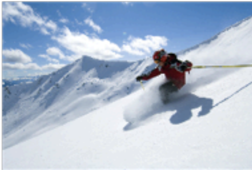
Marmot Basin – 2009