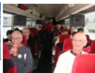
Sun Peaks #2 Sometimes pictures do speak louder than words.