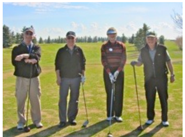
above: First group of the year just before teeing off at Legends.

Please keep in mind that we are always looking for prize donations.